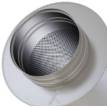
Spigot with groove