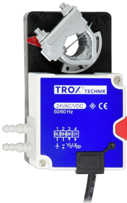
XB0 for TVR, TVJ, TVT, TZ-Silenzio, TA-Silenzio, TVZ, TVA, TVM