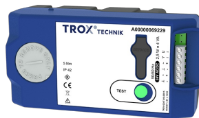
XB0 for TVE