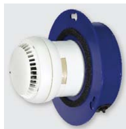
Duct smoke detector RM-O-3-D