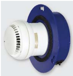
Duct smoke detector RM-O-3-D